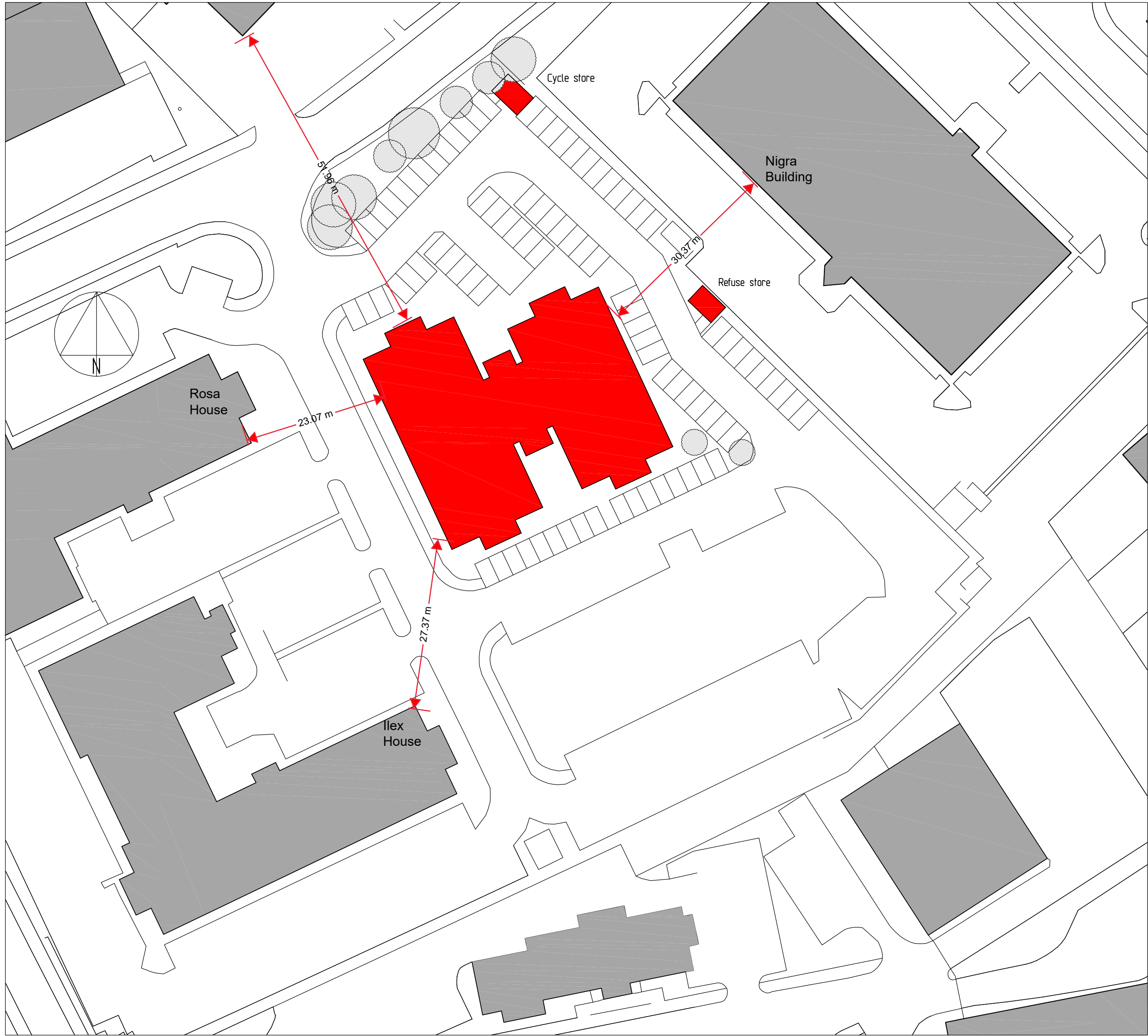
Site Plan 1 : 500